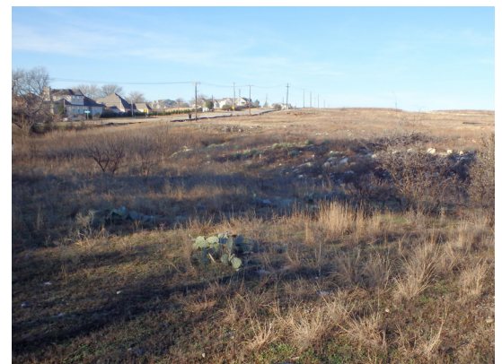
Little Dosier Creek Watershed, 2013

Population growth in urban areas has also increased the amount of wastewater processed by treatment plants and the amount of wastewater discharged to creeks and lakes in the watershed. According to the Texas Water Development Board, populations in the counties that contribute to the Eagle Mountain Watershed are anticipated to grow significantly over the next 50 years, increasing stress on the watershed.