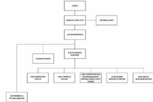
TRWD Organizational Chart