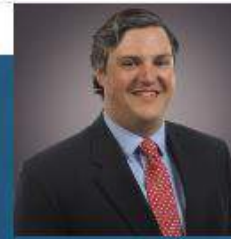
C.B. Team Board Member