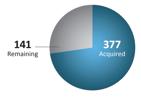
Total Parent Parcels: 518