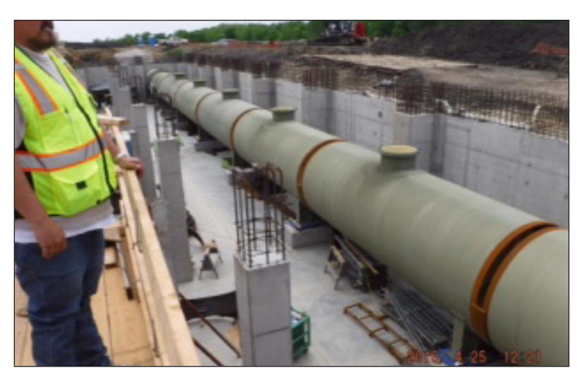
JB3 108-inch discharge header pipe in lower level of JB3 Pump Station