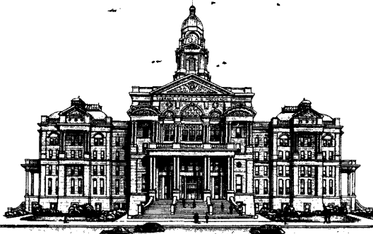
TARRANT COUNTY COURT HOUSE