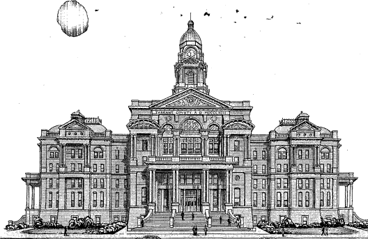
TARRANT COUNTY COURT HOUSE